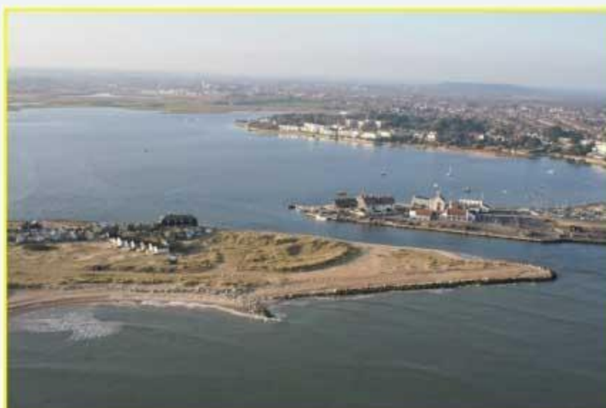
Entrance to Christchurch Harbour at Mudeford