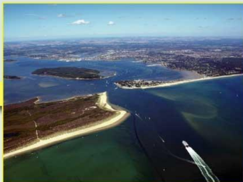
Entrance to Poole Harbour