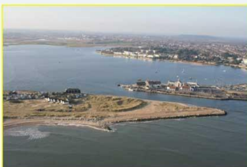
Entrance to Christchurch Harbour at Mudeford