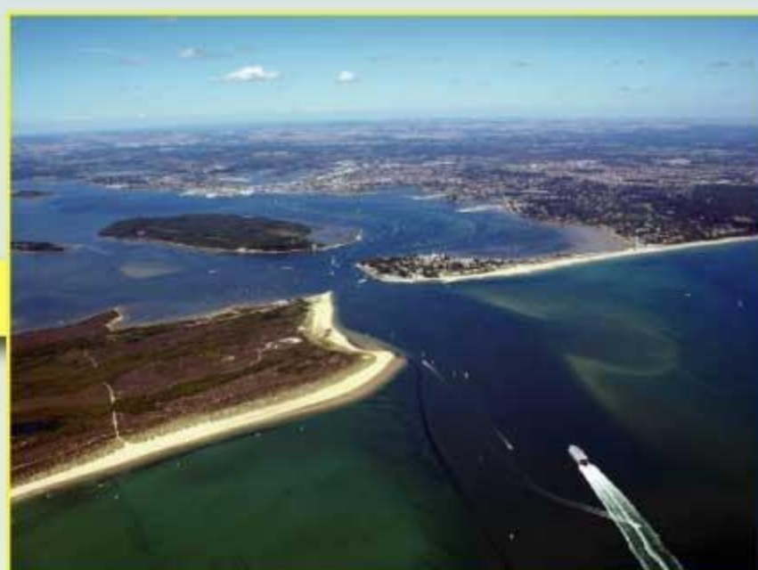
Entrance to Poole Harbour